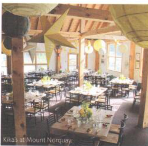
Kika's at Mount Norquay.

fashioned barbecue. And the create-your-own-buffet option for dinner lets companies customize the spread from options including lobster risotto, raw oysters and slow-roasted striploin. After your meetings conclude, your team will fall over themselves to get to the first tee-box of this championship golf course. Include a shotgun-style golf tournament in your formal programming, and cruise the course with your coworkers in GPS-equipped carts with on-screen leaderboard scoring. (2000 Silvertip Trail, Canmore, 403-678-1600, silvertipresort.com)