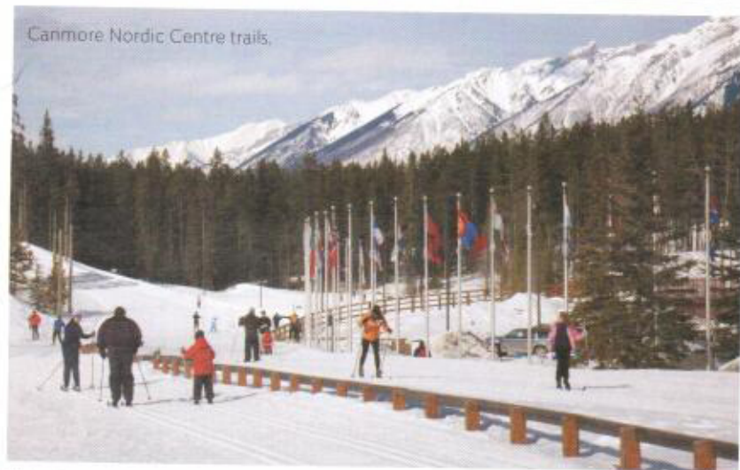
Canmore Nordic Centre trails.

conference centre. Mealtime ranges from custom buffets and sit-down meals to pizza and de platters. Throw in a chocolate fountain and a fully staffed and stocked bar for fun. If you are looking for a party post-meeting, the Mountainside Clubhouse has a stage and dance floor. If you want to bond with your co-workers outside the boardroom, the resort organizes team-building activities that include golf, trail riding, geocaching and cooking. For the truly jet set, Fairmont Hot Springs has a private airport across the river with space to land aircraft up to the size of a 737. (5225 Fairmont Resort Fwy., Fairmont Hot Springs, 800-663-4979, fairmonthotsprings.com)