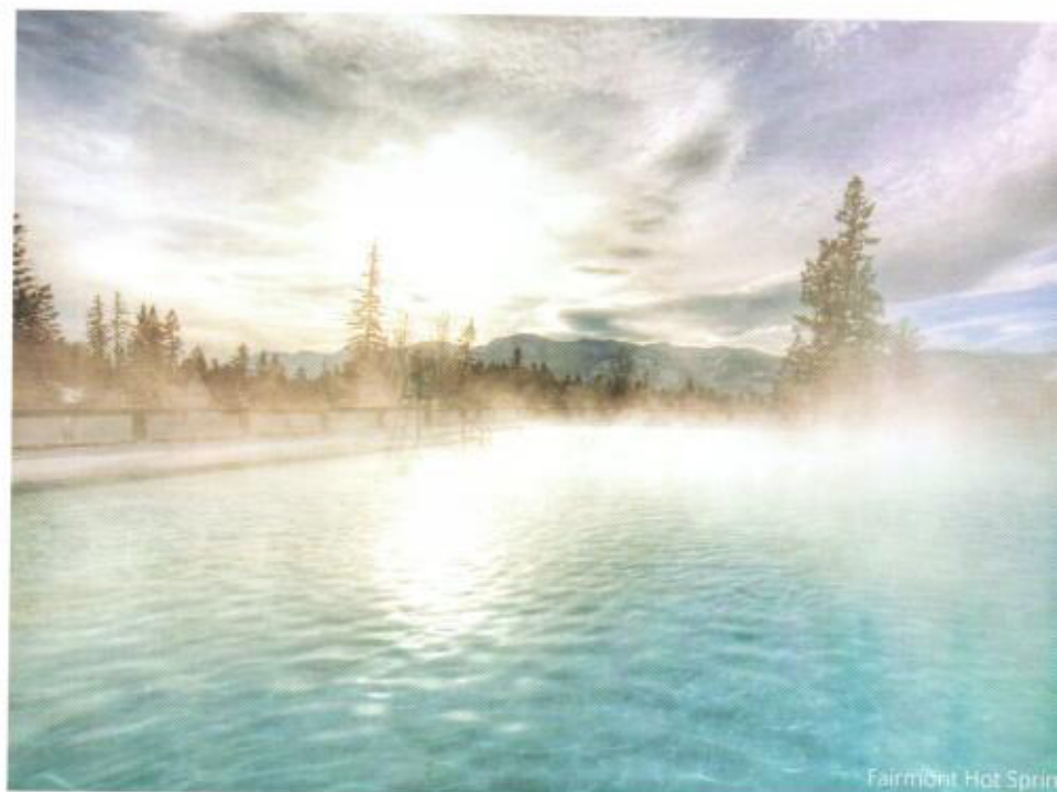
Fairmont Hot Springs

Cyclists, bus tours and Sunday drivers know and enjoy the Bow Valley Parkway, also known as the 1A, as the rest of the world rushes by on the TransCanada. Follow the parkway to Lake Louise and find Baker Creek Mountain Resort just minutes from the Lake Louise townsite. The resort offers overnight accommodation in 35 units that include suites with Jacuzzi tubs and private balconies and chalets with log walls and stone fireplaces. It's a hotel known for comfy duvets and decadent food — ask for the duck-in-a-jar at Baker Creek Bistro. It also has a hidden talent in accommodating private business meetings for up to 30 participants in the Heritage Centre, and there are smaller breakout areas available. The centre is equipped with digital projection systems, and it only hosts one event at a time, so your corporate secrets are safe. Once the meetings are done, toast your colleagues to a job well done along the creekside next to a roaring campfire. (Bow Valley Pkwy., Lake Louise, 403-522-3761, bakercreek.com)